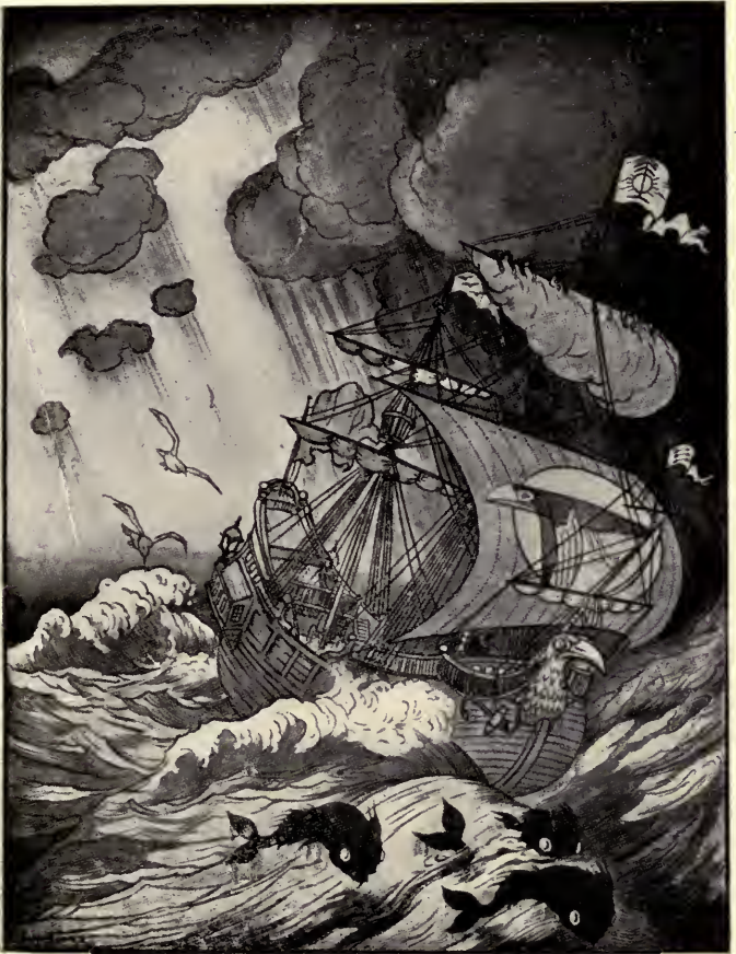
BIRD OF THE RIVER